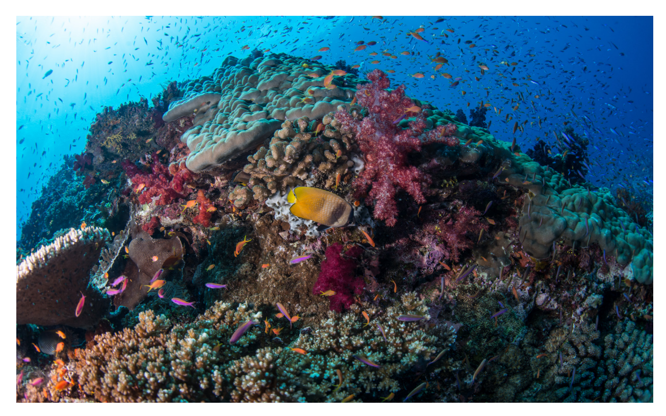
This coral reef ecosystem is home to a huge number of different species.