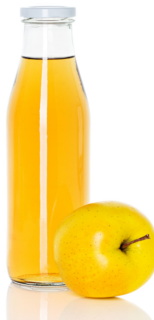
It may not look like one, but apple juice is a mixture.

Why should you care whether your diving tank contains oxygen or a mixture of gases? It makes a big difference. By itself, oxygen can be a dangerous substance. Oxygen gas catches fire easily, so it's difficult to handle, and oxygen can be unhealthy to breathe underwater without other gases mixed in. Divers learn which gas mixtures to use for diving. For some dives, they might use the already-existing mixture of gases found in air. For other dives, people make special blends of oxygen, nitrogen, and helium. Safe diving is all about finding the right mixture!