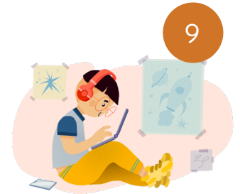
Allowable use #9 Edtech software to support educational interaction between teachers and students