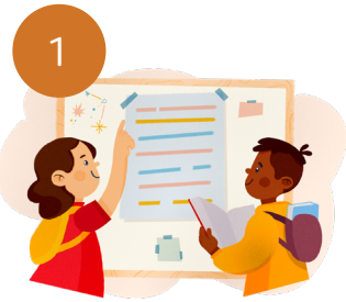
Allowable use #1 Activities that support federal requirements, including ESEA; Title I, II, III, and IV; and IDEA

For a full list of allowable uses, please review this CRRSA document from the U.S. Department of Education.