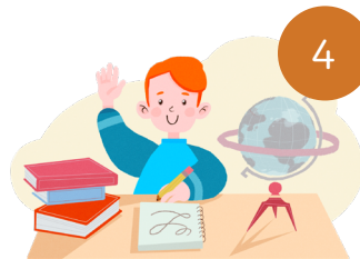
Allowable use #4 Activities for low-income students, students with disabilities, or minority students