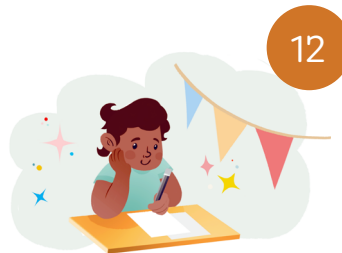
Allowable use #12 Activities that measure and address learning recovery and acceleration among low-income students, students with disabilities, or minority students