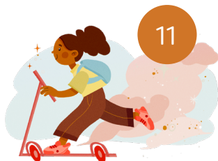
Allowable use #11 Summer school and after-school summer programs for low-income students, students with disabilities, or minority students

All Amplify programs and trainings meet these seven requirements: