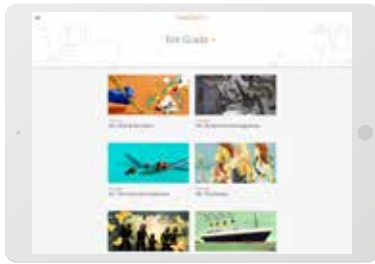
Digital Teacher Edition