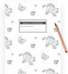
Student Writing Journal