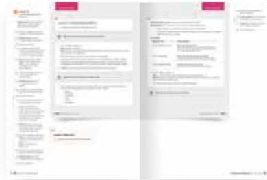
Print Teacher Edition