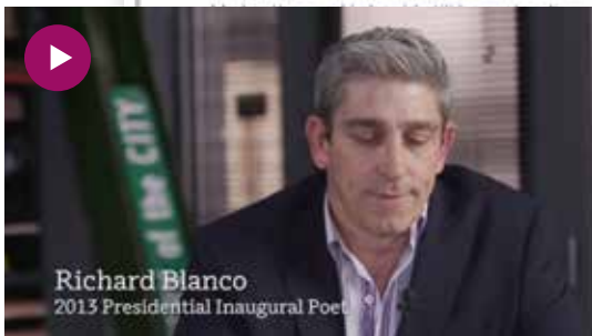
Author Richard Blanco reading his poem “Looking for the Gulf Motel”

The Gulf Motel with mermaid lampposts and ship's wheel in the lobby should still be rising out of the sand like a cake decoration.