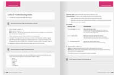
Interactive print Student Edition