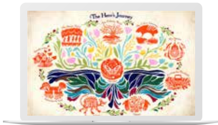
Digital Student Edition