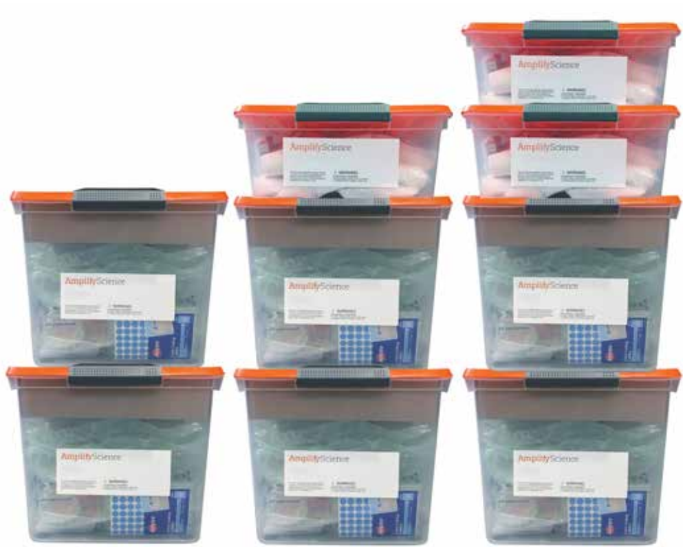
This image is a representative sample and does not reflect the exact number or size of tubs included with each grade level.

Amplify Science also offers a starter kit that includes general science materials needed to conduct most hands-on activities and experiments for all units in our curriculum.